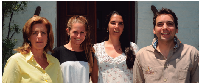
River Plate trip coordinators