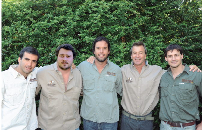
A few of our wingshooting associates.

During 30 years of outfitting for our discerning guests, we have selected the best shooting grounds in Uruguay and Argentina, and perfected our services and logistics like no one else in the business so that you will enjoy the trip of a lifetime.