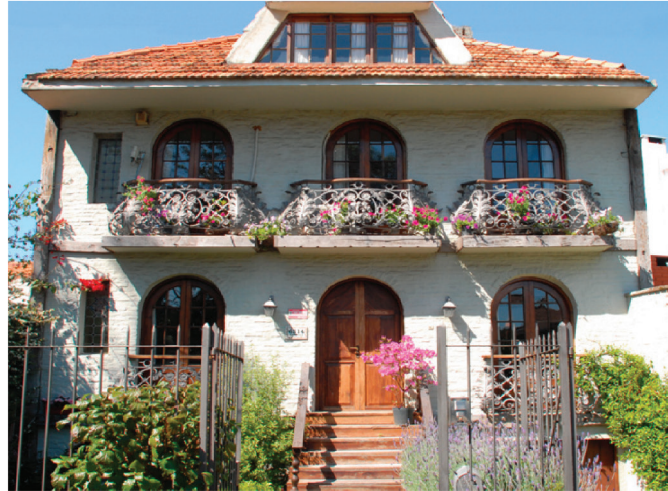
Headquarters at Montevideo

We look forward to seeing you at one of our shooting estancias among our many returning guests, all of whom we regard as friends.