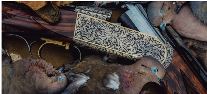
Dove hunters are strategically placed near the few freshwater holes in the area (all the rest are saltwater)